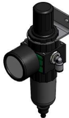
Parker filter regulator